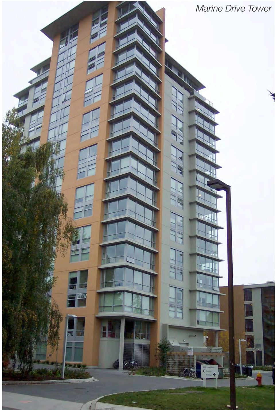
Marine Drive Tower

be found on the convention website ( abcevents.ca ). In addition, soon you will find a link to the UBC Campus map on the website, so you can familiarize yourself with the location of the various venues for the convention.